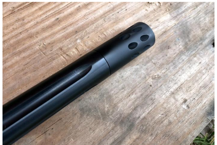
Fluted and threaded barrel