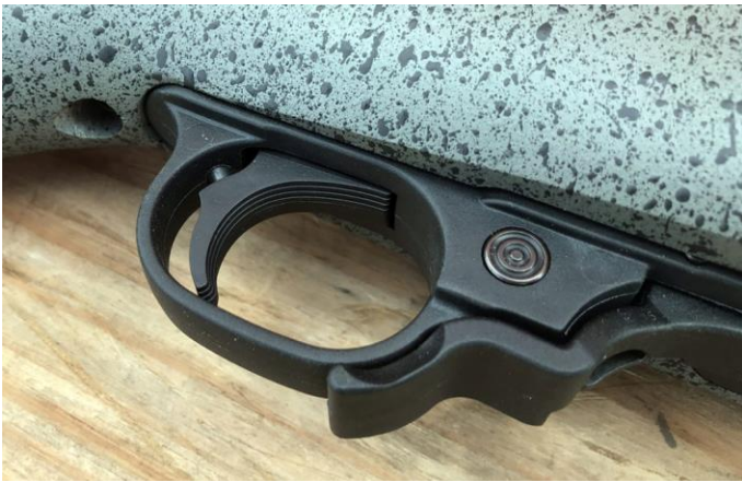
Extended mag release