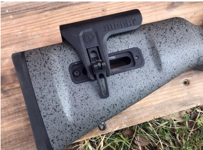
Horizontal and Vertically adjustable comb