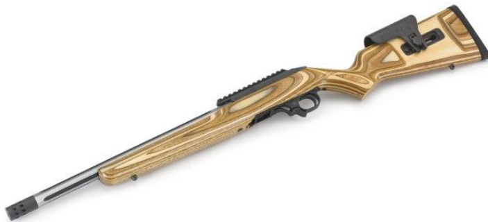
Brown Laminated Stock