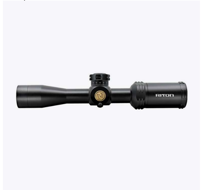
RT-SMOD1, 3-9X32, WIDE FOV

They offer a full line of rifle scopes, red dot sights, and binoculars. Below are just a few of their products.