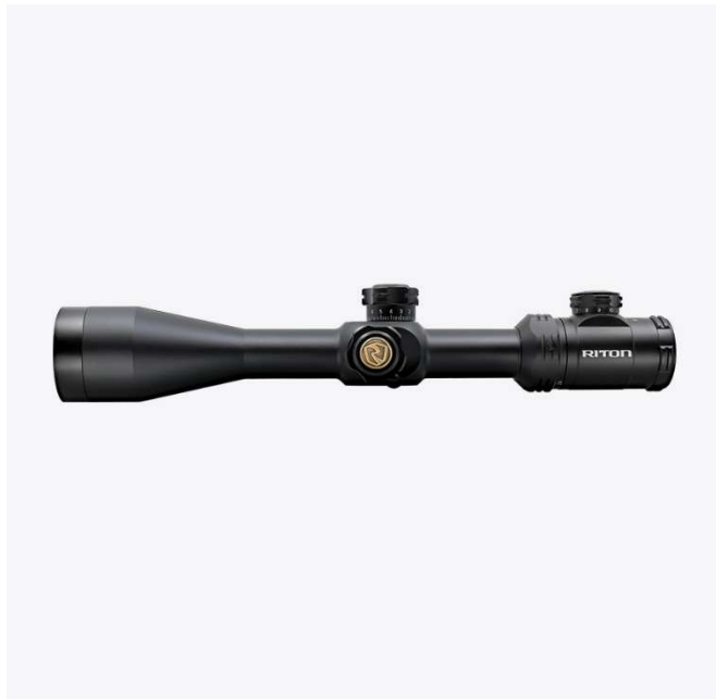
RT-S MOD 5 GEN2 6-24X50IR-FFP

Features: Center Crosshair Illuminated Ranging Reticle, First Focal Plane (FFP), parallax dial, HD glass, 30mm tube, waterproof, shockproof, fog proof. MSRP: $569.99